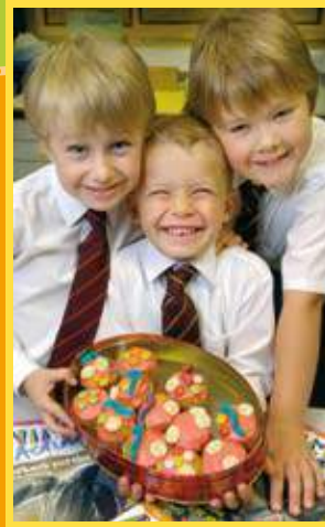
CAT