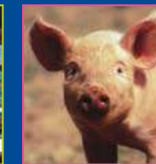
LAMB AND PIGLET